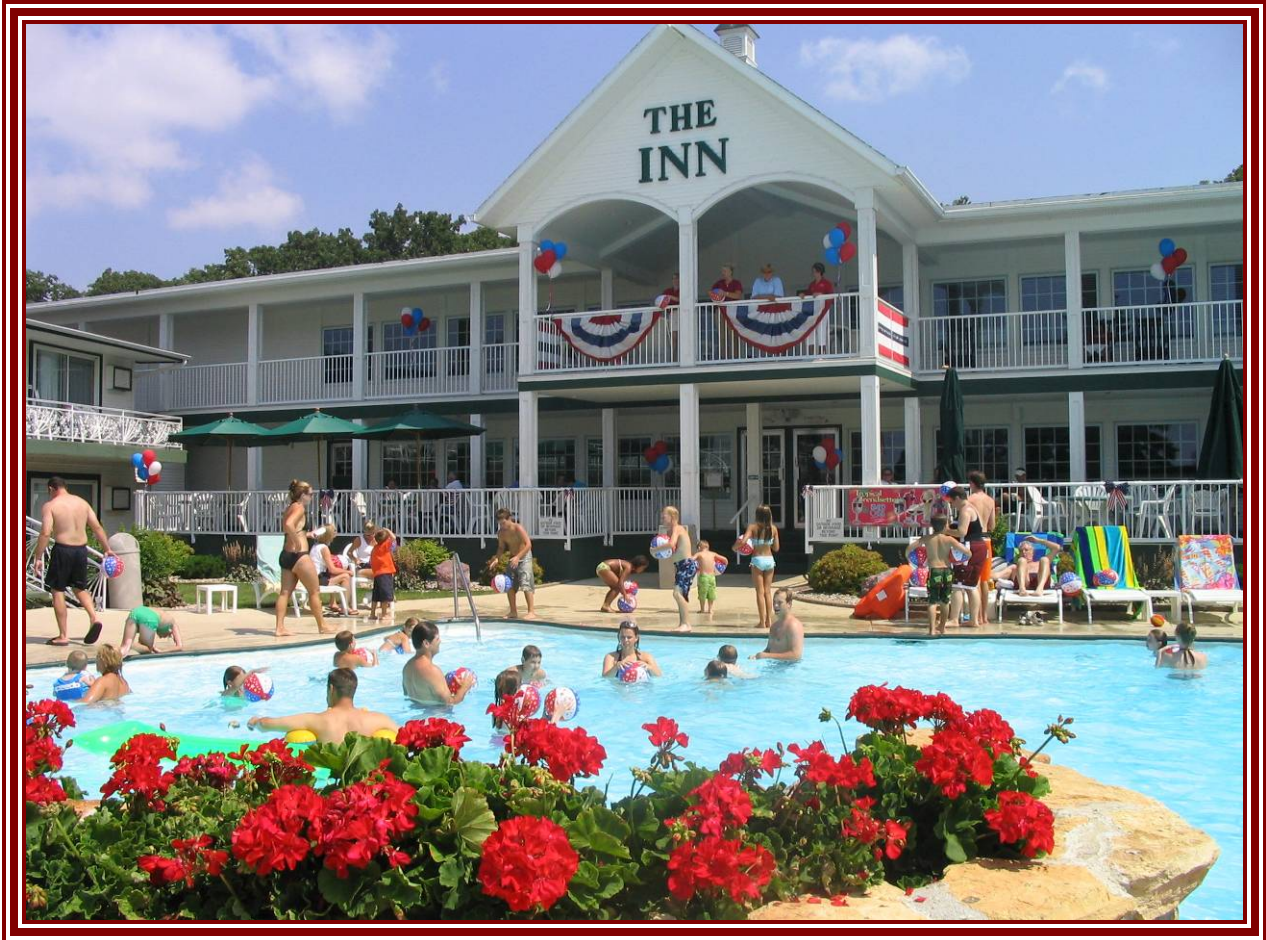
The Inn at Okoboji Okoboji, Iowa