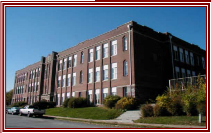
Park School Omaha, Nebraska