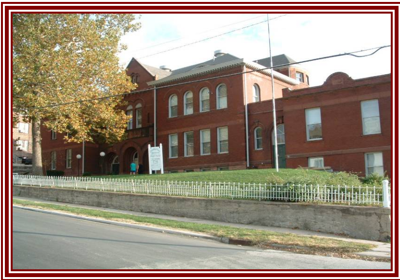
Columbian School Omaha, Nebraska