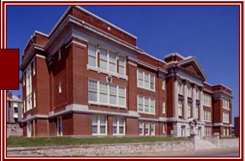
Robidoux School St. Joseph, Missouri